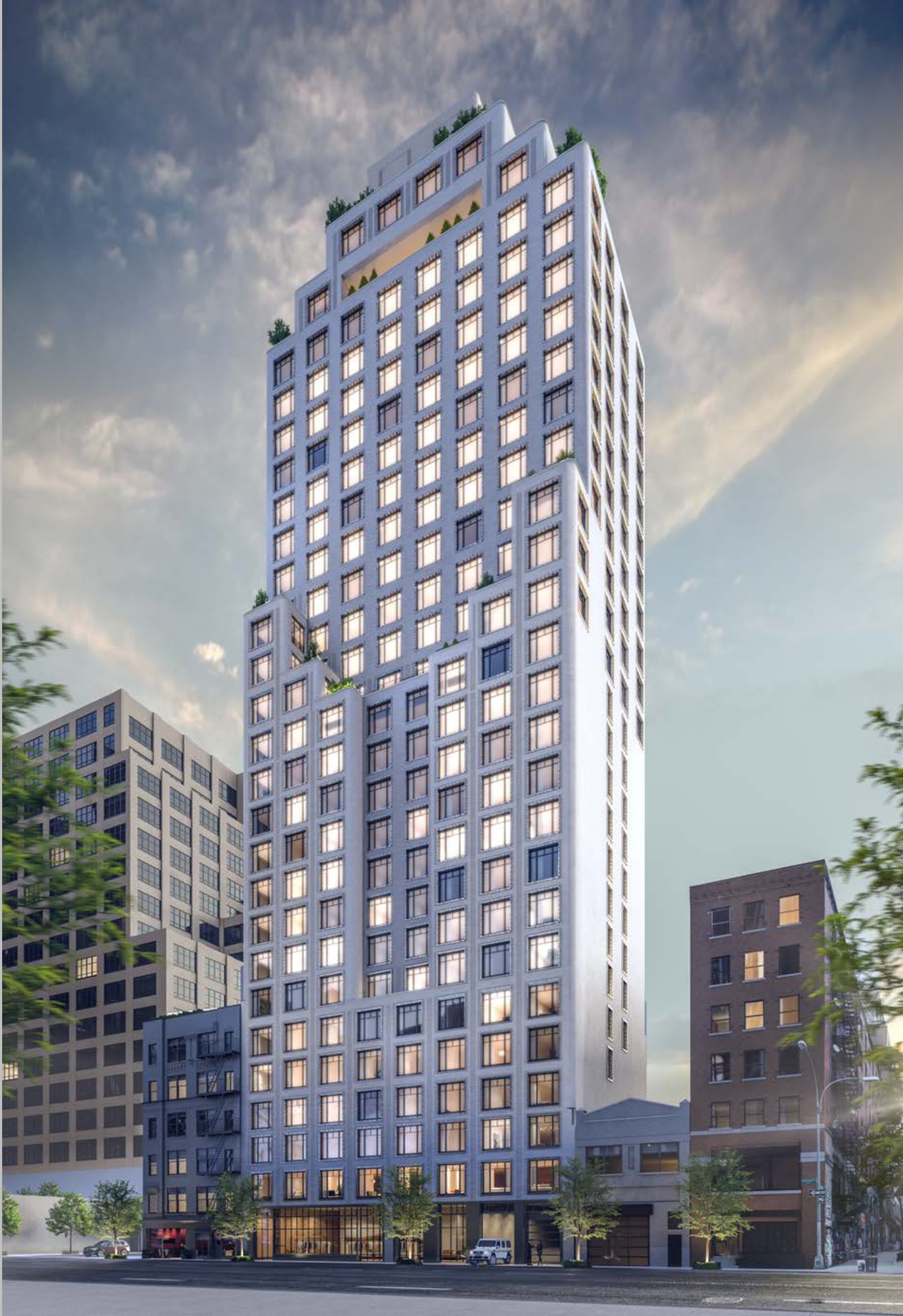
GREENWICH WEST BUILDING

Tucked in a quiet corner of West Soho, Greenwich West is a bold newcomer to downtown New York. Located just a short walk from the waterfront, this striking full-service tower is a modern reinterpretation of the classic New York loft building. Designed by an innovative Parisian design team, the building is inspired by the neighborhood's maritime industrial legacy. With expansive views of the New York skyline and Hudson River, the stylish interiors reflect Manhattan's golden age of residential glamour, while twenty-first century amenities and services root Greenwich West firmly in the present.