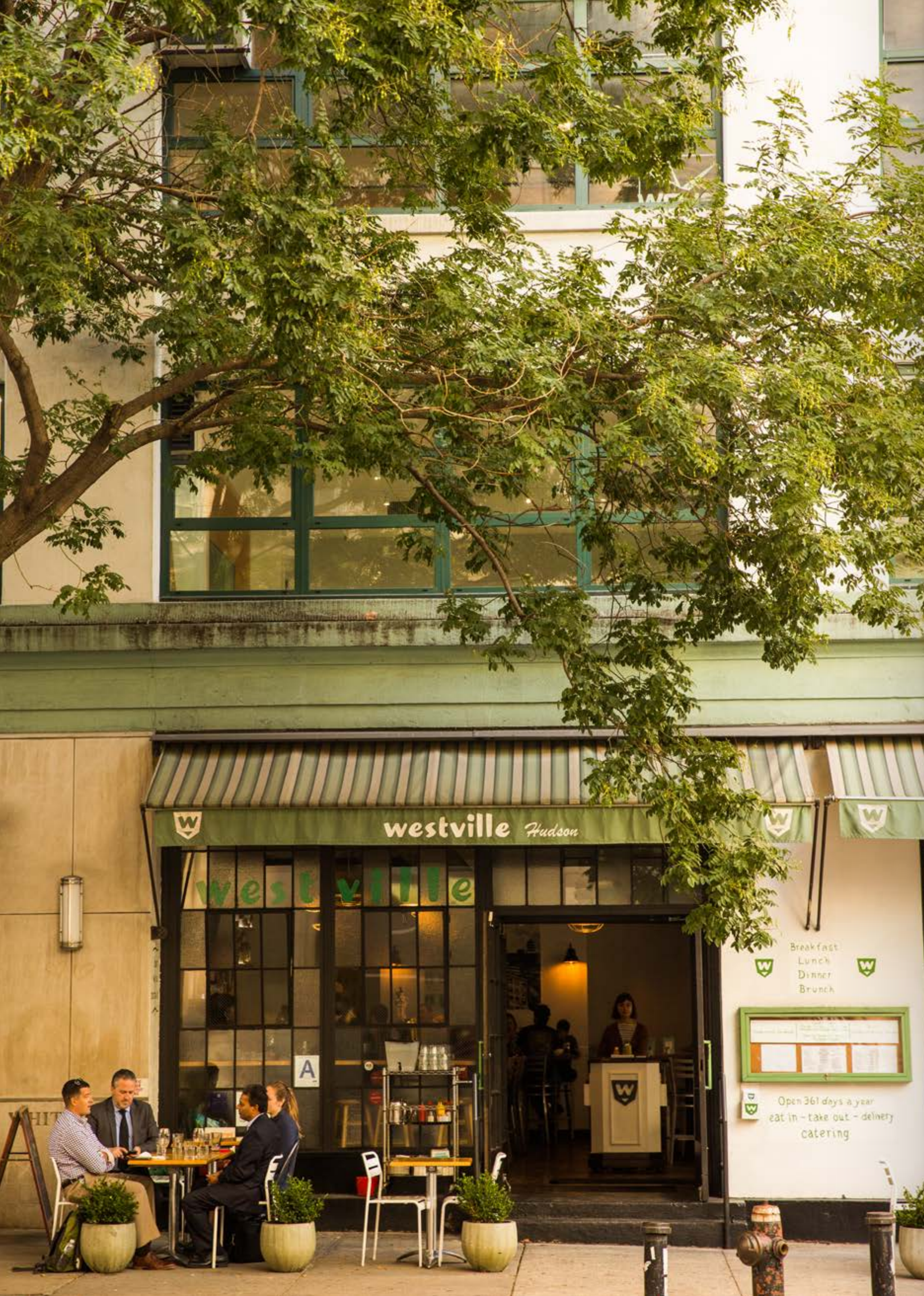
WESTVILLE RESTAURANT ON HUDSON STREET