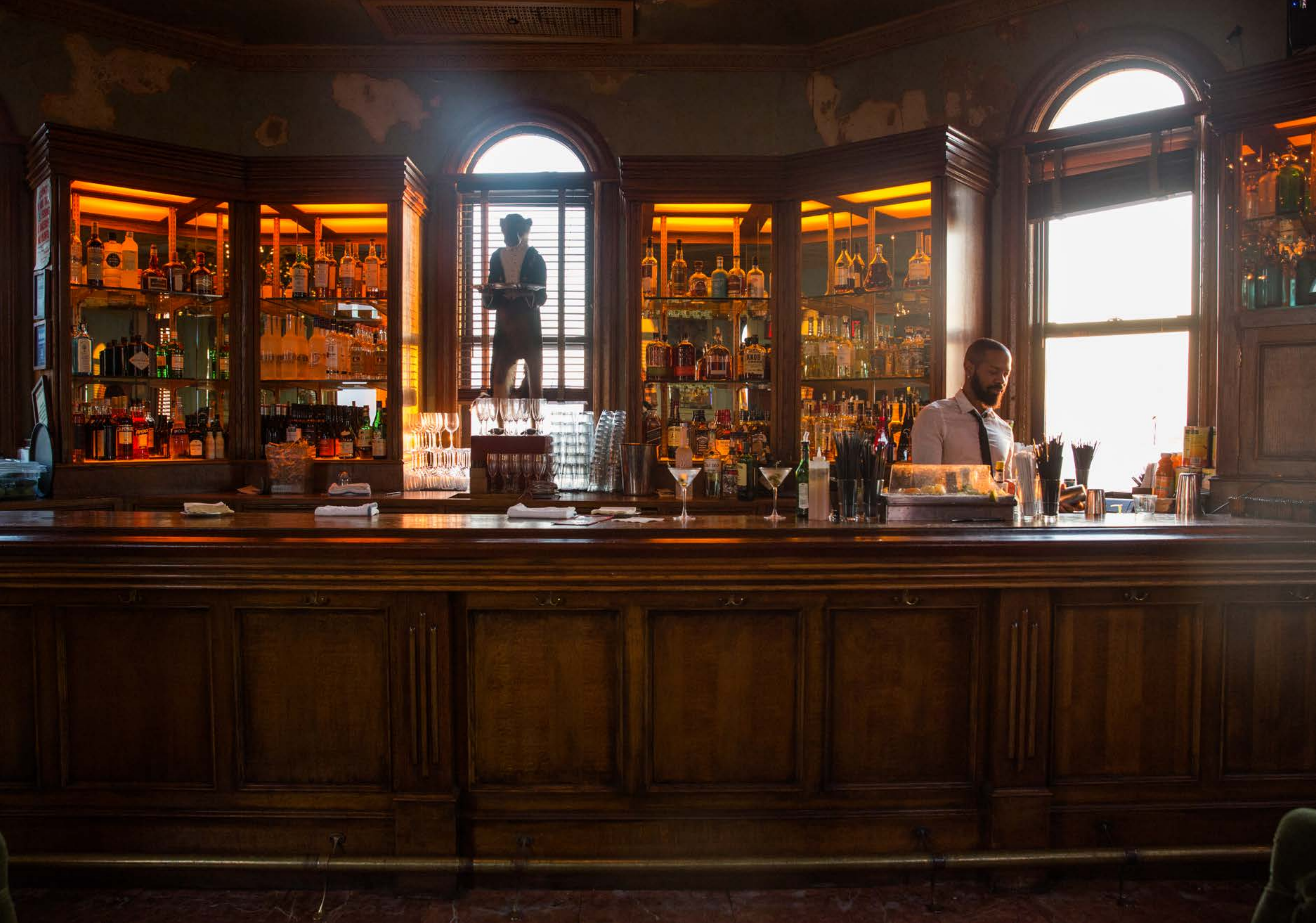
THE JANE HOTEL ROOFTOP BAR ON JANE STREET